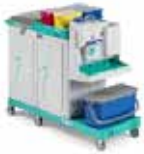
Magic System 800E