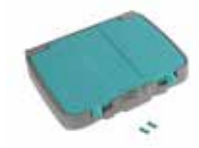
Double bottom lid for 120 L bag holder